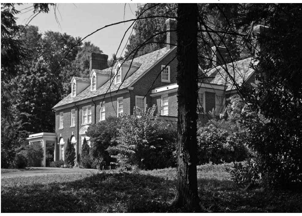
Mildred & Robert Hanes House, 140 North Stratford Road (1926-27).