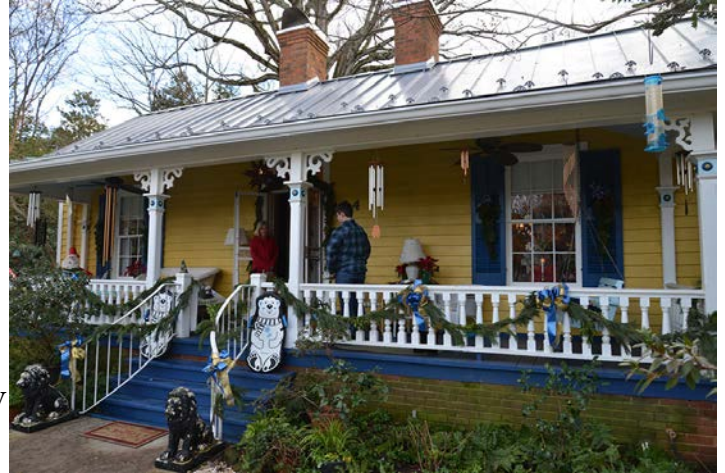
The Poindexter Cottage at 124 West End Blvd., during the West End Holiday Homes Tour, Dec. 16, 2018