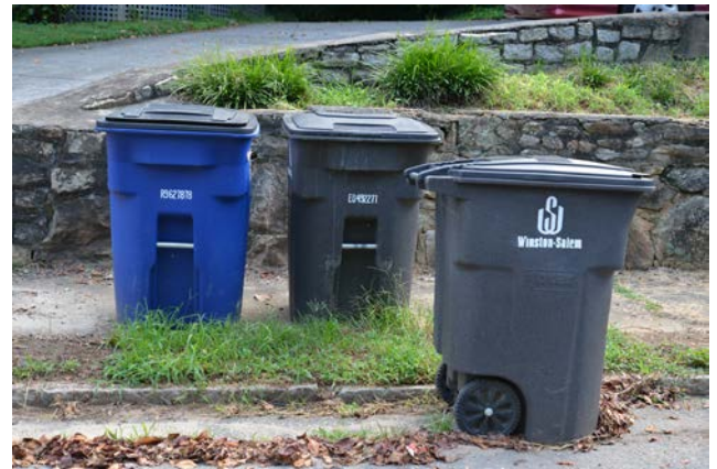
Trash and recycle bins left at the curb on West End Blvd days after the collections, Sept. 2018.

Trash/recycle bins blocking sidewalks. The citizens of Winston-Salem are fortunate to have efficient services for removal of solid waste, yard waste, and recycling. When those carts are left on sidewalks on days not designated for collections they detract from the appearance of the neighborhood and often become obstacles for pedestrians. City Code requires property owners to place these carts at the curb no sooner than 6PM on the day before a scheduled pickup and to remove them from the curb and sidewalk no later than the day following pickup. The West End Overlay District Guidelines require further that these carts be stored in locations that are not visible from the street and screened from public view . Apartment owners have a particularly difficult time meeting these regulations as complexes tend to have many of each kind of bin. Residents of the apartments should be aware of the requirement to remove carts from the street in order to help the owner to comply with the City codes. Carts that are left at the street should be reported to CitiLink or to the Historic Resource Commission staff so the City can identify the owner and encourage them to properly store the carts.