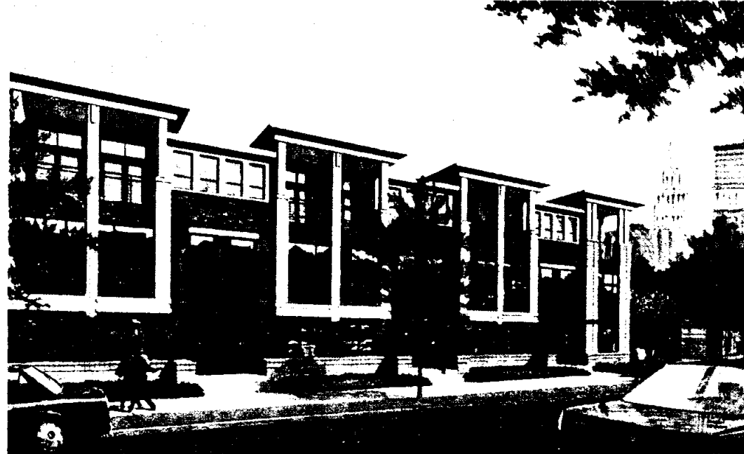
Here's an artist's rendering of "the Towers," the second planned condo development in the West End Village at the northwest corner of Broad St. and Holly Avenue.

1066 W 4 th Street Winston-Salem, NC 27101 336-723-7731