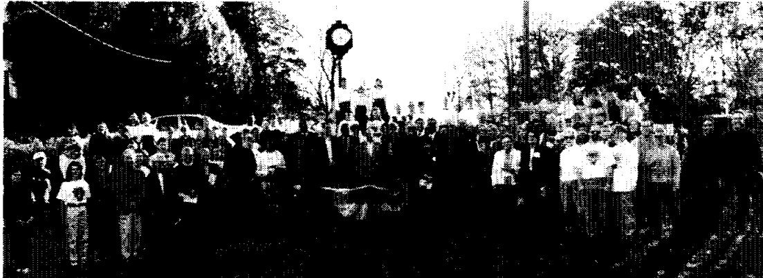
November 12, 2000 Time Capsule Dedication

418 West End Boulevard Winston-Salem, NC 27101 336-721-0076